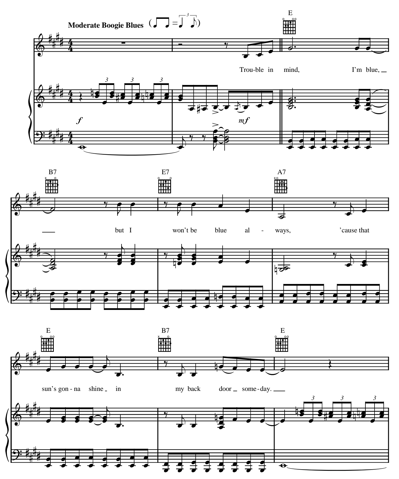
© 1926, 1937 Universal - MCA Music Publishing, A Division of Universal Studios, Inc. Copyrights Renewed All Rights Reserved