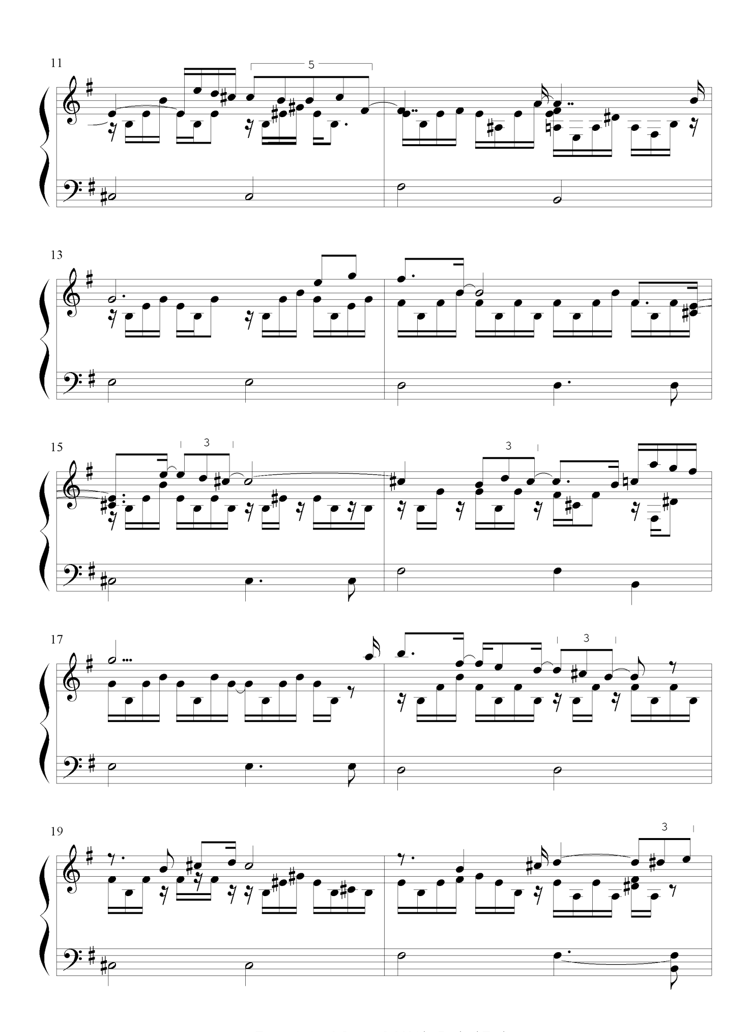
Transcription & Layout © 2004 by Raphael Turbatte